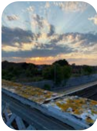
Sunset from Deal Station