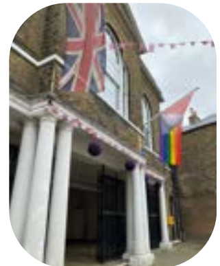
Deal Town Hall