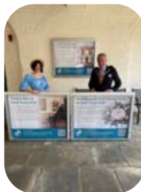
New artwork in the Undercroft

The Undercroft was greatly enhanced by new artwork created by a local Ukrainian artist, commissioned to showcase the beauty of the Town Hall and all the services we provide, giving visitors a clearer insight into what we offer.