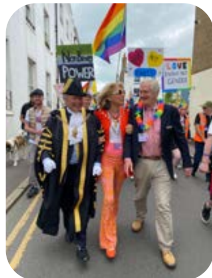
The Mayor and Mayoress at Deal Pride

As I look back on this mayoral year, I do so with immense gratitude. It has been a pleasure to represent this vibrant town, and I am confident that with shared purpose, Deal will continue to flourish. The future is bright when we face it together.