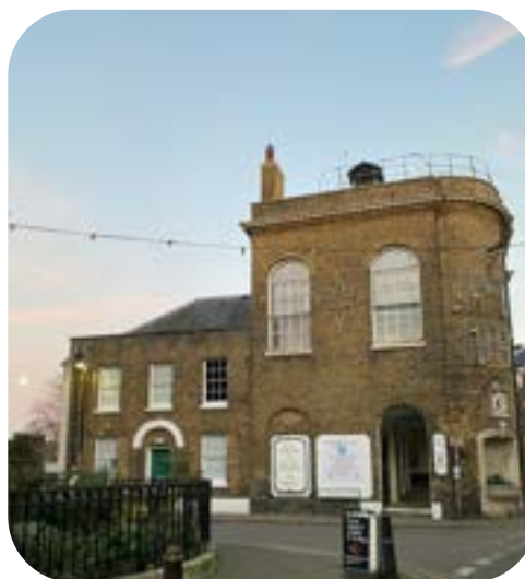
Deal Town Hall

Deal Town Council had a stand, and we gave away 100 free bee-bombs to local residents so they could plant flowers at home and spread the rainbow across the town!